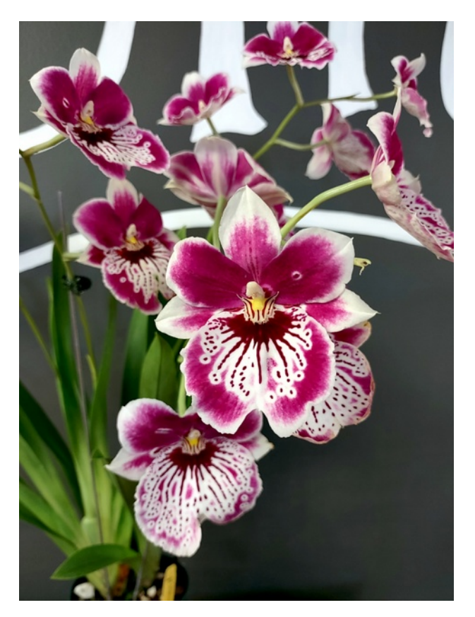
Above, Right - Miltoniopsis Milton Brown