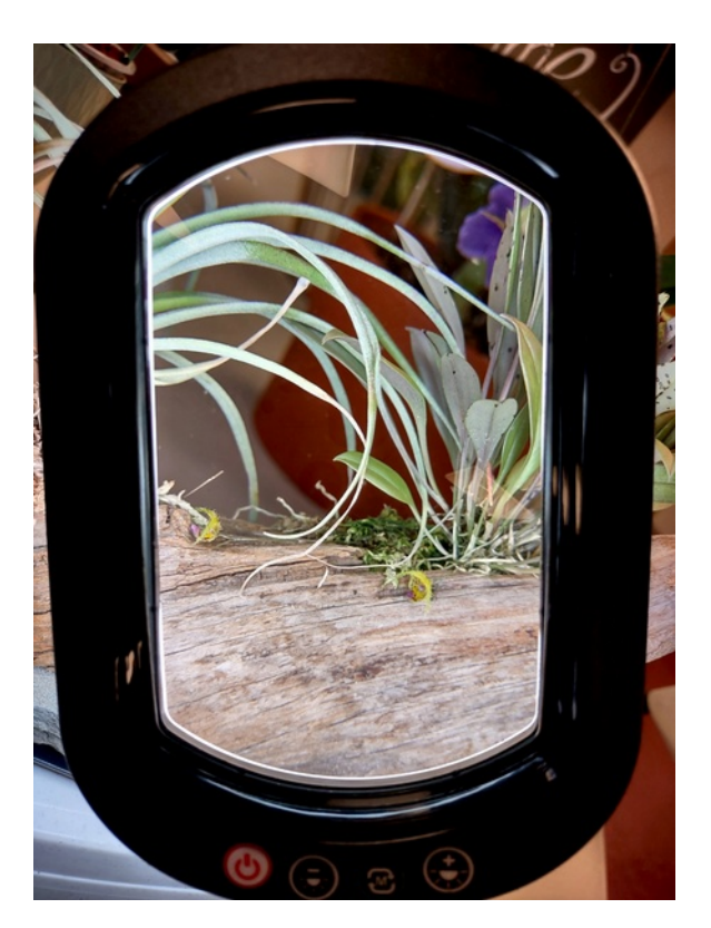
Clockwise from top left: Jason brought in a Scaphosepalum fimbriatum mounted to a branch. The bloom is truly miniature, so he brought in a magnifying lamp for club members to view the strange flowers.