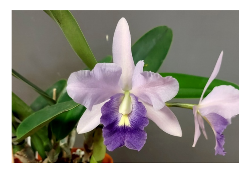
Left: Cattleya mossiae var. semi alba